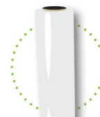
Pallet wrap & stretch film