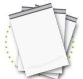
Plastic shipping envelopes