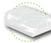
Wood pellet bags